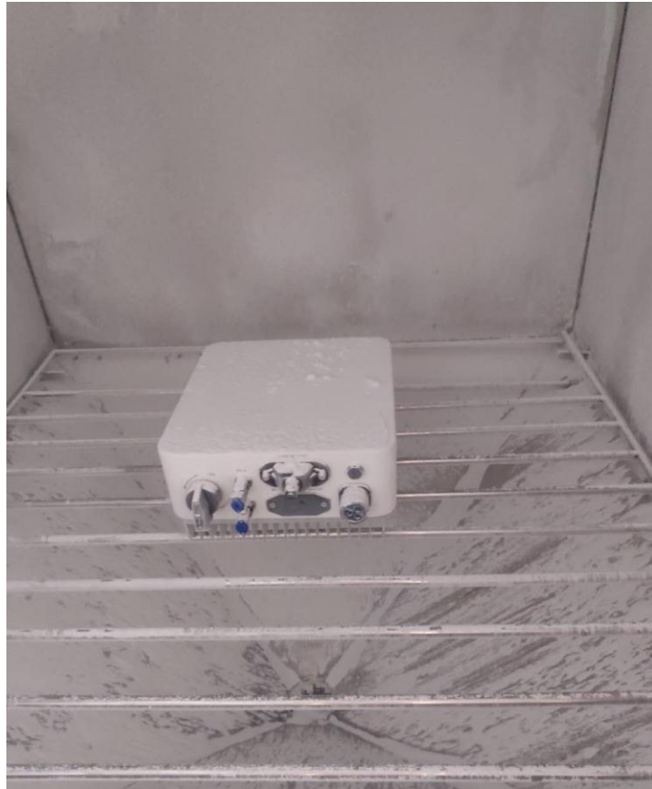
Test setup of IP6X