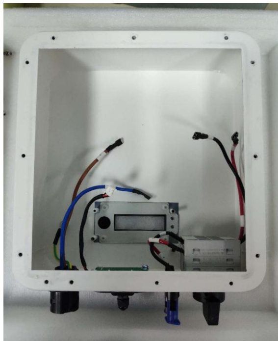
Checked after test finish