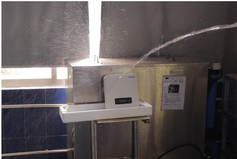
Test setup of IPX5